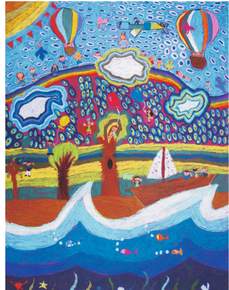
Zejnep Kilinc age 7 Turcja